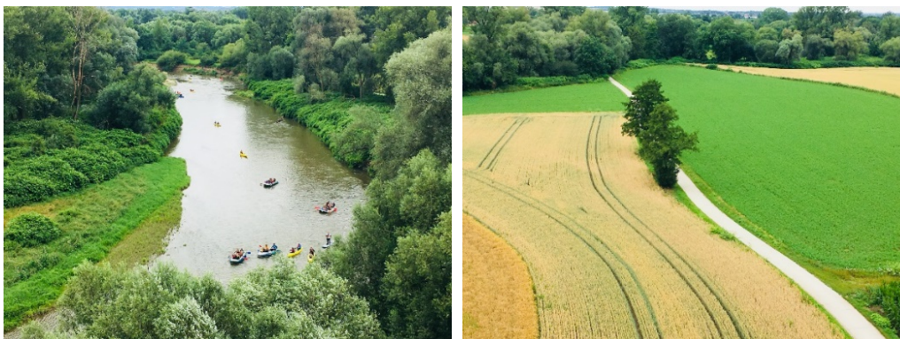
A view from the tower