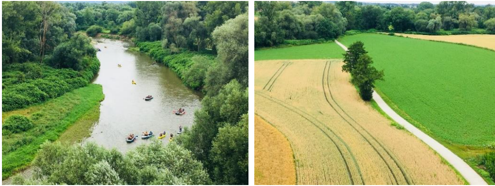
A view from the tower