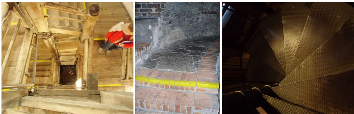
Staircase inside Trúba