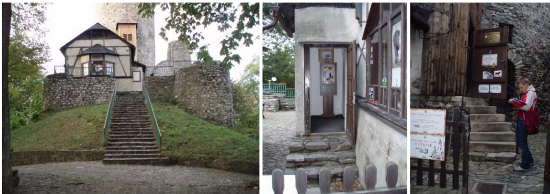
From left: Access to the castle, entrance to the ticket office, entrance to Trúba