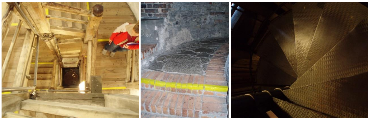
Staircase inside Trúba