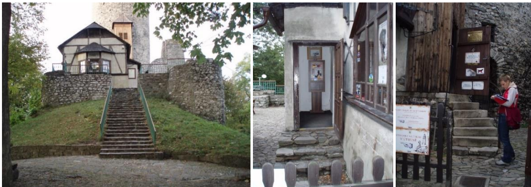
From left: Access to the castle, entrance to the ticket office, entrance to Trúba