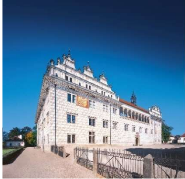
From left: Castle hill, castle