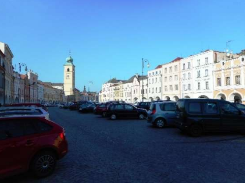
From left: House At the Knights (beginning of the route), Smetana Square