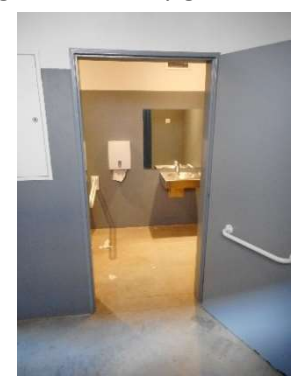
From left: WC building in the castle premises, entrance to the wheelchair WC cabin in the castle premises