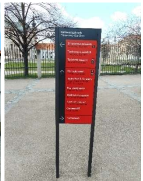
From left: Church of the Exaltation and Road to the Square, town signs