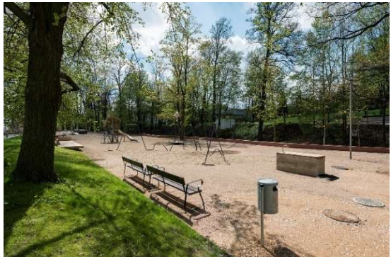
From the left: Monastery Gardens, Water embankment Park