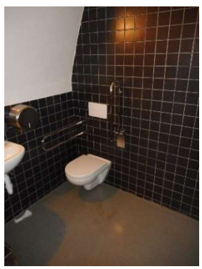
From left: WC Smetana Square, WC building in Monastery gardens, WC in Monastery garden