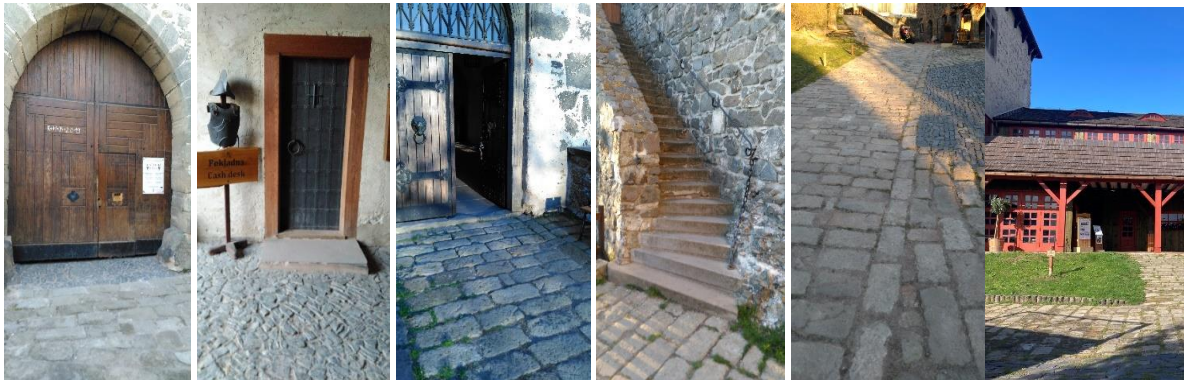
From left: Main gate (entrance to the ticket office and the courtyard), entrance to the ticket office, entrance to the castle palace, stairs to the chapel, courtyard surface, a new ticket office