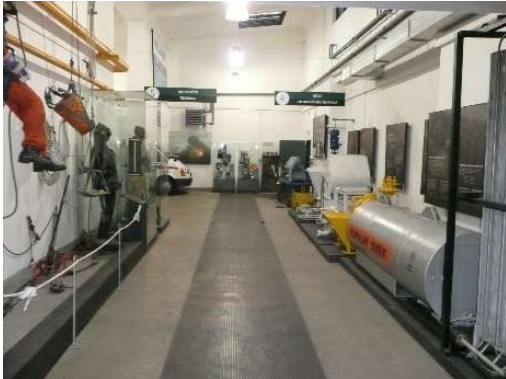
From left: Entrance to the cloakroom, the interior exposition of the mining rescue