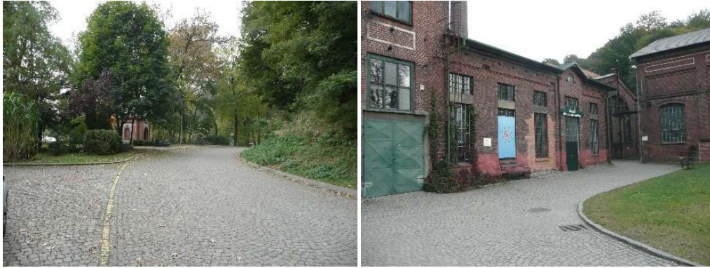
From left: Access road from the car park, access to the ticket office