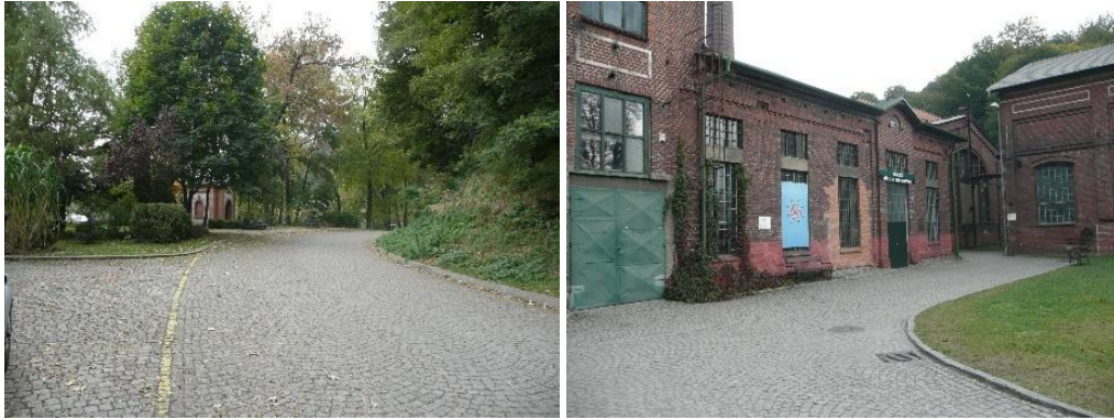
From left: Access road from the car park, access to the ticket office