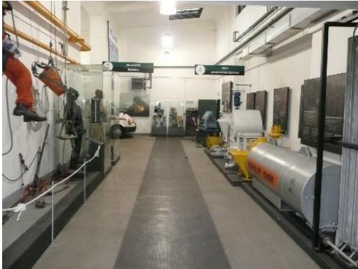
From left: Entrance to the cloakroom, the interior exposition of the mining rescue