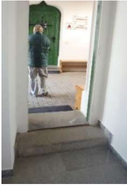
From left: Entrances to the castle, stairs and staircase on the tour route