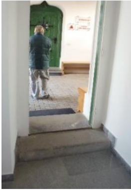
From left: Entrances to the castle, stairs and staircase on the tour route