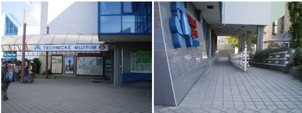
From left: Area before entering the museum, ramp to the museum access path