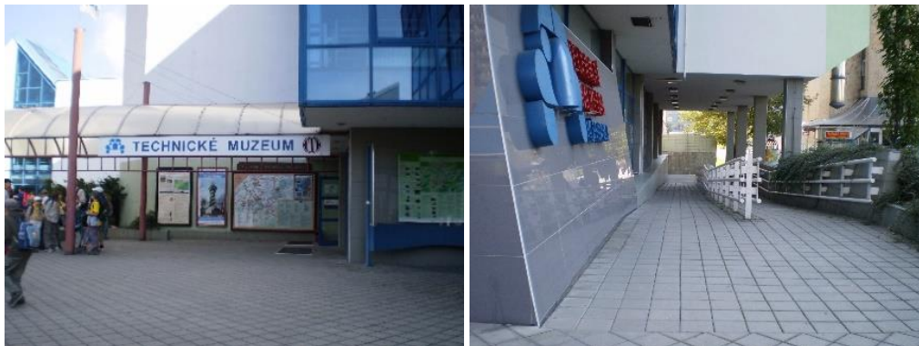
From left: Area before entering the museum, ramp to the museum access path