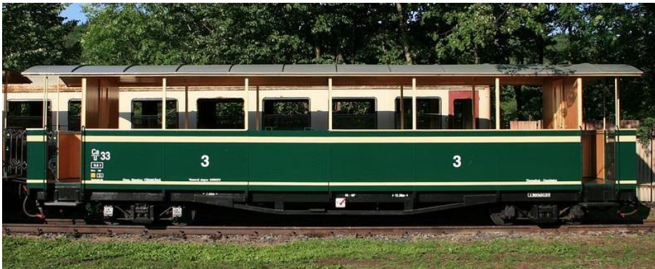
Cruise coach for the transport of immobile persons