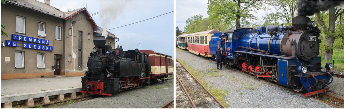
From left: Platform in Třemešná and Osoblaha