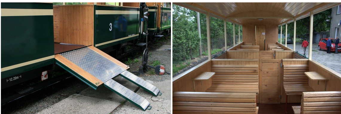
From the left: Tilting platform and coach interior for disabled persons