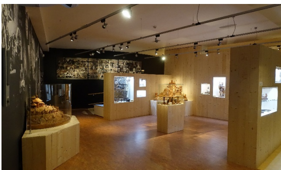
From the left: Exposition