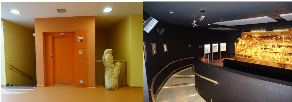
From the left: elevator, exposition of nativity scene of Probošt – spiral ramp