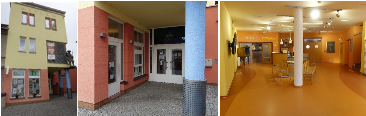
From the left: Museum building, Entrance to the museum and vestibule