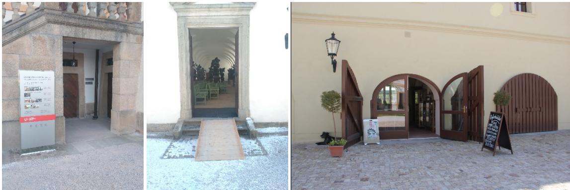
From the left: entrance and ticket office, lapidarium entrance, herbal shop entrance