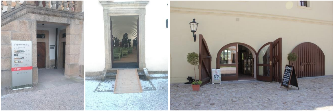
From the left: entrance and ticket office, lapidarium entrance, herbal shop entrance