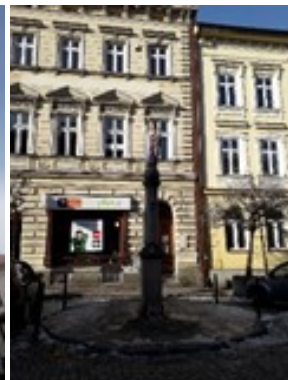
From left: Square - Town Hall, Church of St. Maria Magdalena, Madonna and Child