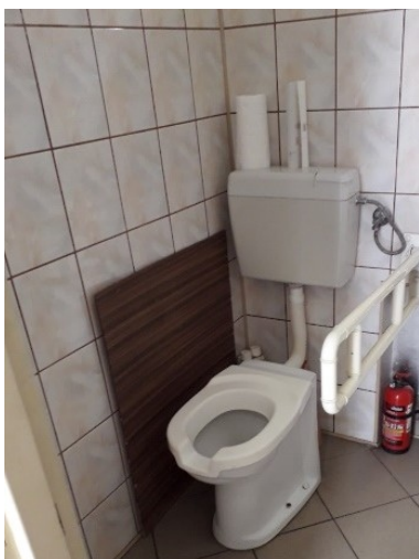
Public toilet - Ratuszowa Street