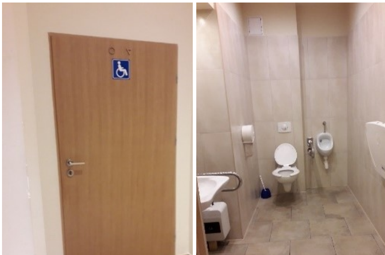
Wheelchair accessible toilet in the town hall.