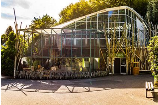
Entrance to the Tropics Pavilion