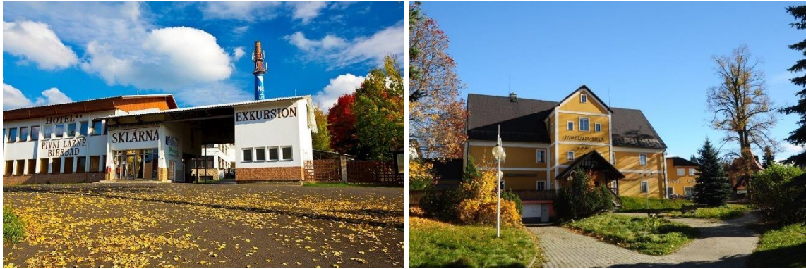
From left: Entrance to reception building, museum premises