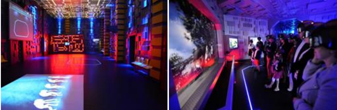
Exposition and audiovisual screenings