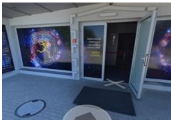
The main entrance