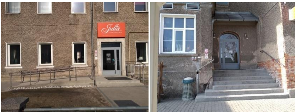
The main and the side entrance (ticket office, café, shop)